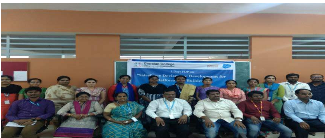
Valedictory Function Group Photo with FDP Participants