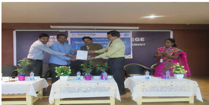
Exchanging the Membership Certificate between ICT-Academy and GCEM