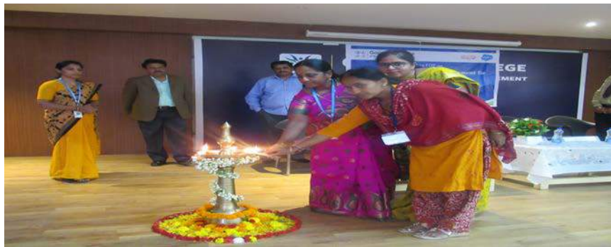
Lightning of the Lamp