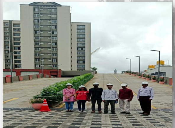
GOPALAN FLORENZA, BENGALURU

On site Exploration of Advanced Construction Techniques And Equipments at Gopalan Projects like Mivan Construction Techniques, Ready mix concrete plants, Tower cranes, Mobile cranes , etc. Subject specific case studies and regular site visits planned to impart the practical knowledge of the construction industry